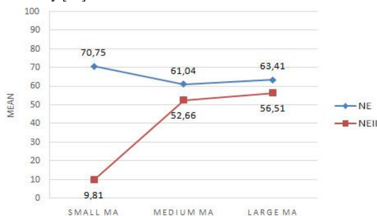
Figure 1. Comparison of the Average Results of NE and NEII across Different Groups of Private MAs

The small difference of achievement among the students of private MAs and public MAs raises a suspicion that there is a contribution of pseudo performance of this group of small private MAs. The various limitations of small private MAs make it difficult for small private MAs to conduct good quality learning process. Under such conditions, teachers, students and other stakeholders at the institutions compromise and together they commit a fraud. For them, NE's result has a very strong impact to their image. The fraud that they do is an effort to maintain a good name, even improve the image of the MAs in society [15]